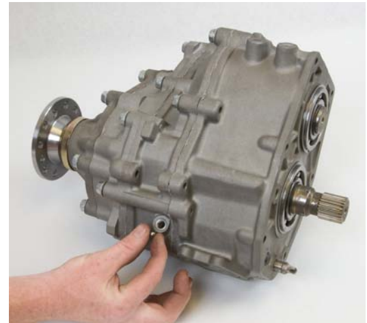
Step 15 Turn the t-case over. Drop the detent ball into the hole.