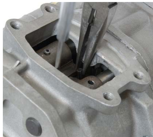
Step 7 Using needle nose pliers, remove the roll pin from the magnet. If the pin falls into the case, roll the case over and remove it.