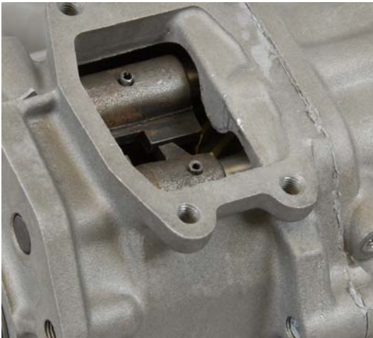
Step 14 Firmly tap in the roll pin until it is nearly flush.