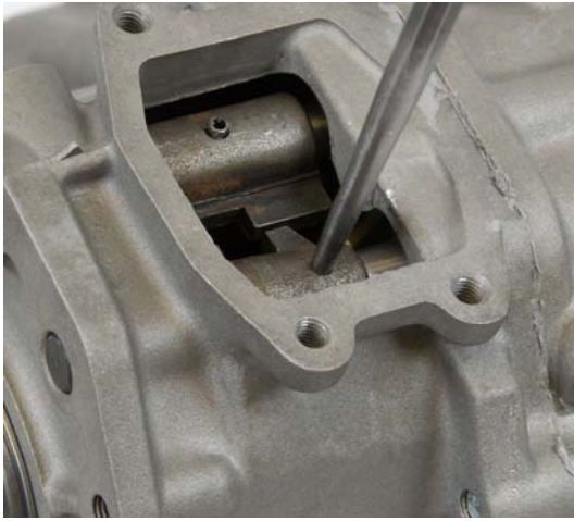
Step 12 Align the shift rail hole and the shift fork hole with each other using a long pin punch.