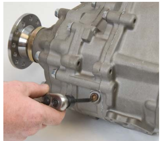
Step 17 Insert the detent plug into the hole using a 6mm allen wrench. Turn the t-case back over.