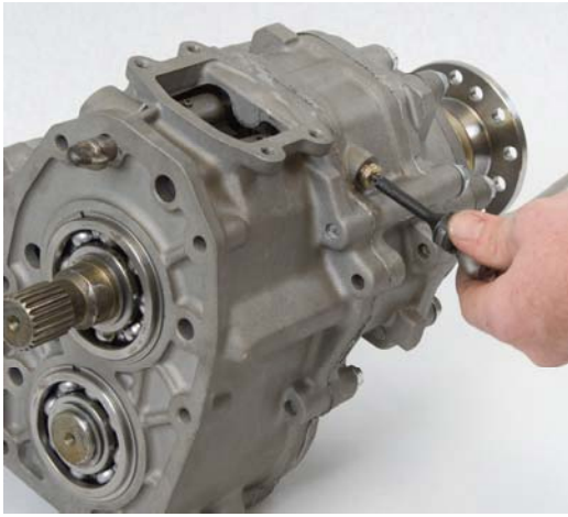
Step 2 Remove the detent plug on the drivers side of the t-case using a 6mm allen wrench.