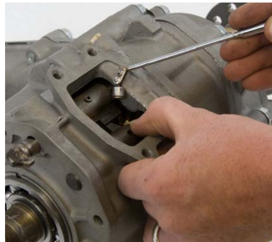
Step 5 Slide the drivers side shift rail forward until it stops. Insert a magnet under the shift rail to catch the roll pin.