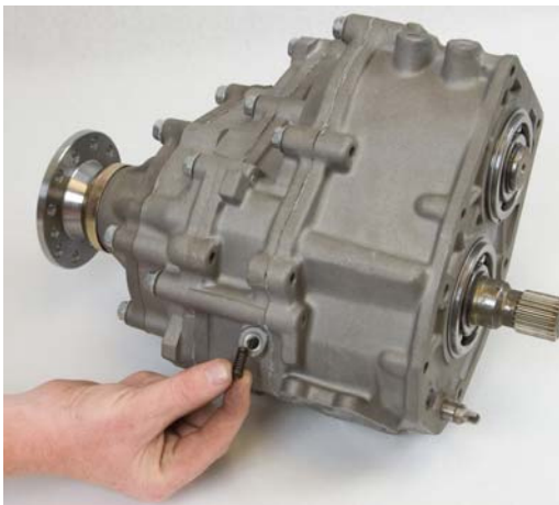
Step 16 Drop the detent ball spring into the same hole.