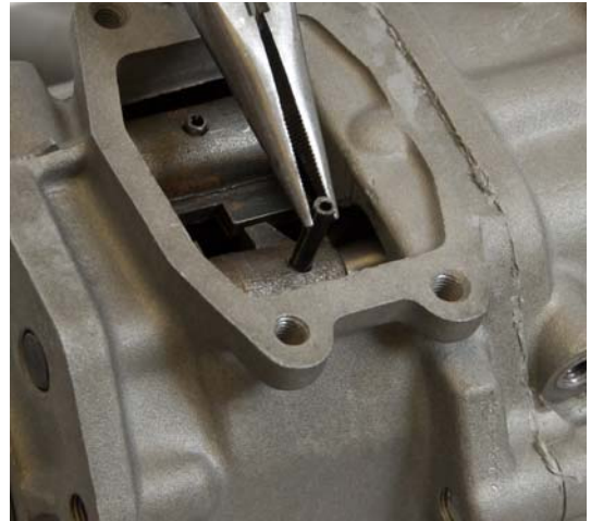
Step 13 Once aligned, remove the pin punch and insert the roll pin using the needle nose pliers.