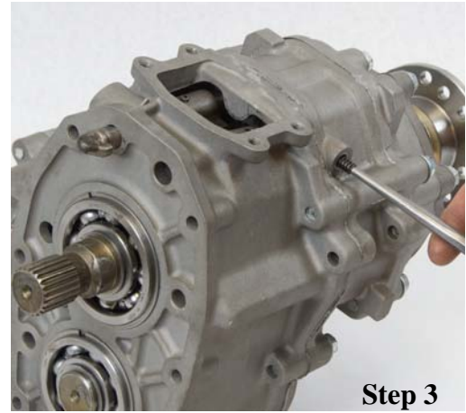
Step 3 Using a magnetized long pin punch, remove the detent spring. If a magnetized pin punch is not available, roll the t-case over for the spring to slide out of the hole.