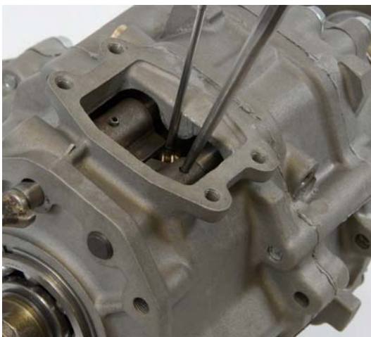
Step 6 With the magnet in position under the shift rail, tap out the roll pin with a punch.