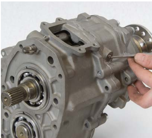
Step 4 Using a magnetized long pin punch remove the detent ball.