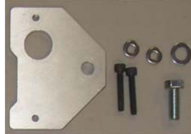
Map Sensor Mount Plate

Hardware: 2 - 10/24 x 1 Allen Screw 2 - #10 Flat Washers 1 - 8mm x 1.25 x 20mm Hex Bolt 1 - 8mm Flat Washer