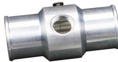
Water Temp Sender Relocator