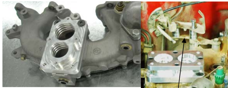
Bell Crank Assembly